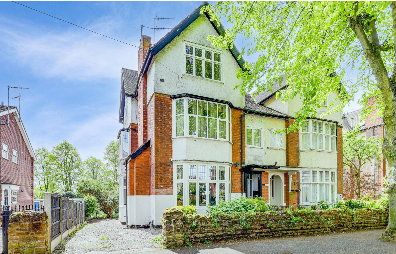
Burlington Road, Sherwood, Nottinghamshire NG5 2GR